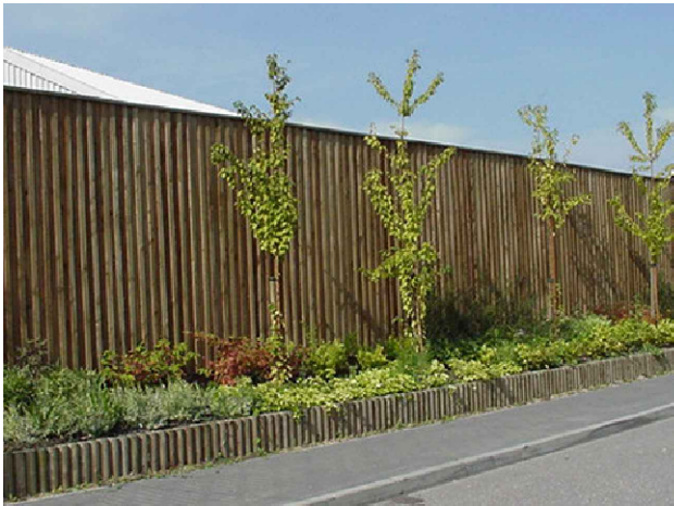
TYPICAL CLOSED BOARD FENCE IMAGE